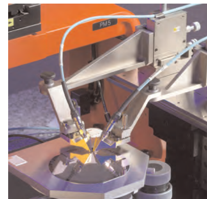
Testing HF on PM5 (for small budgets)