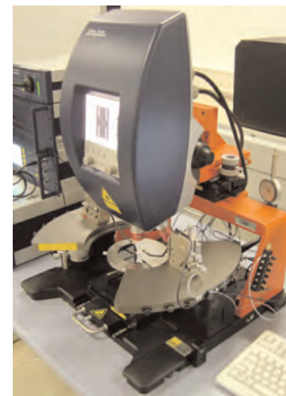
MEMS testing with SUSS PM5 and Polytec MSA 400