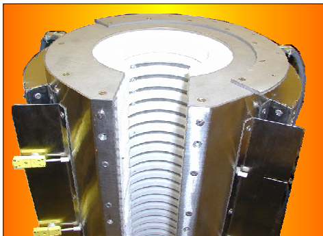
Mellen EDG Omega Furnace

The Electro Dynamic Gradient Precision Furnace System lends itself to a wide variety of applications. Wherever the need exists for precise applied gradients , the EDG can be adapted.